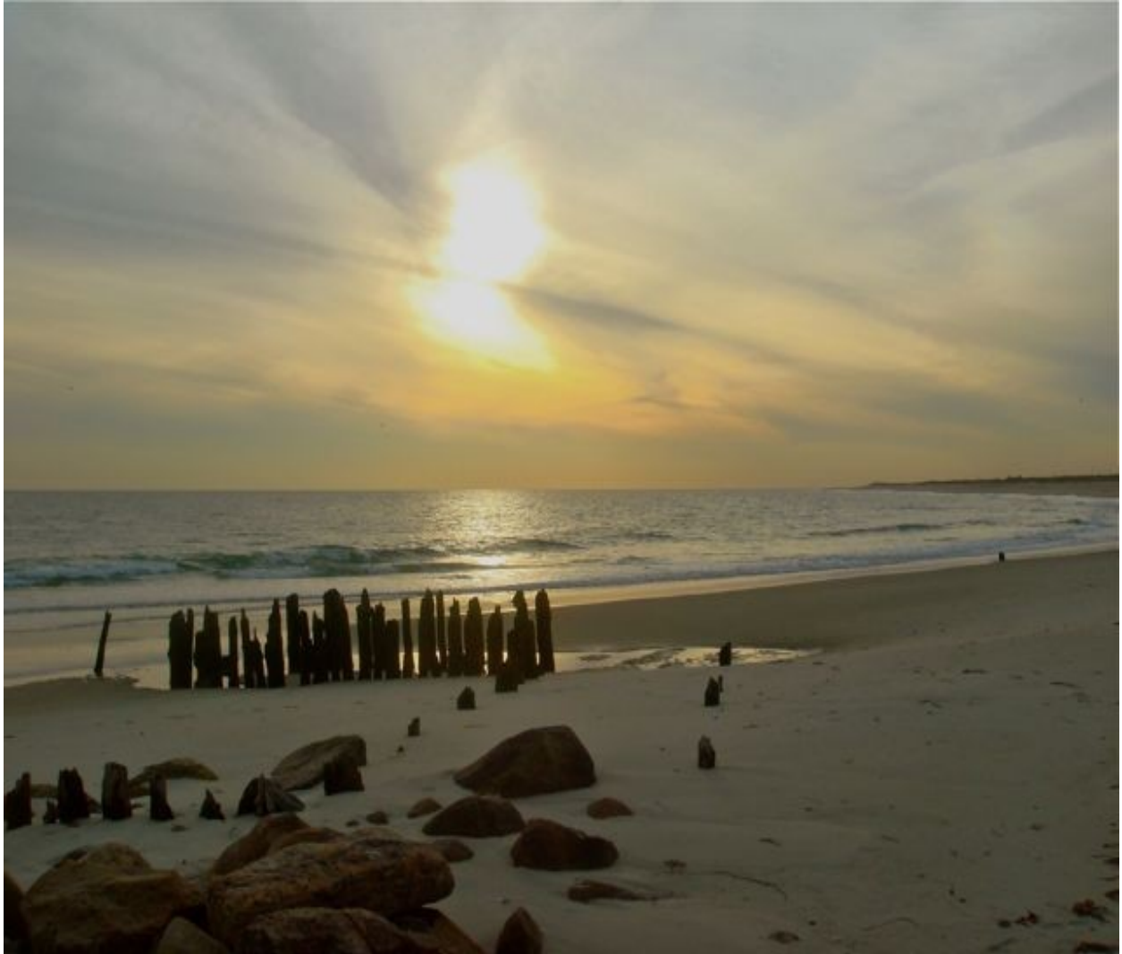
A Walk on the Beach