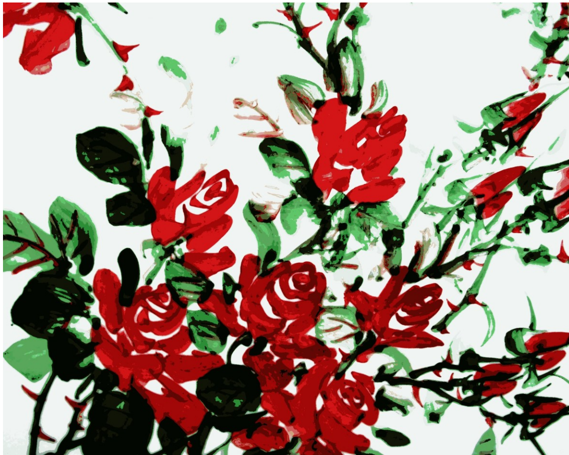
Roses