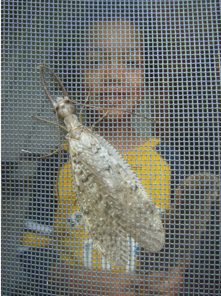
The Boy and a Very Big Bug

Coins was first published on the website in July and appears here as an Editor's Choice.