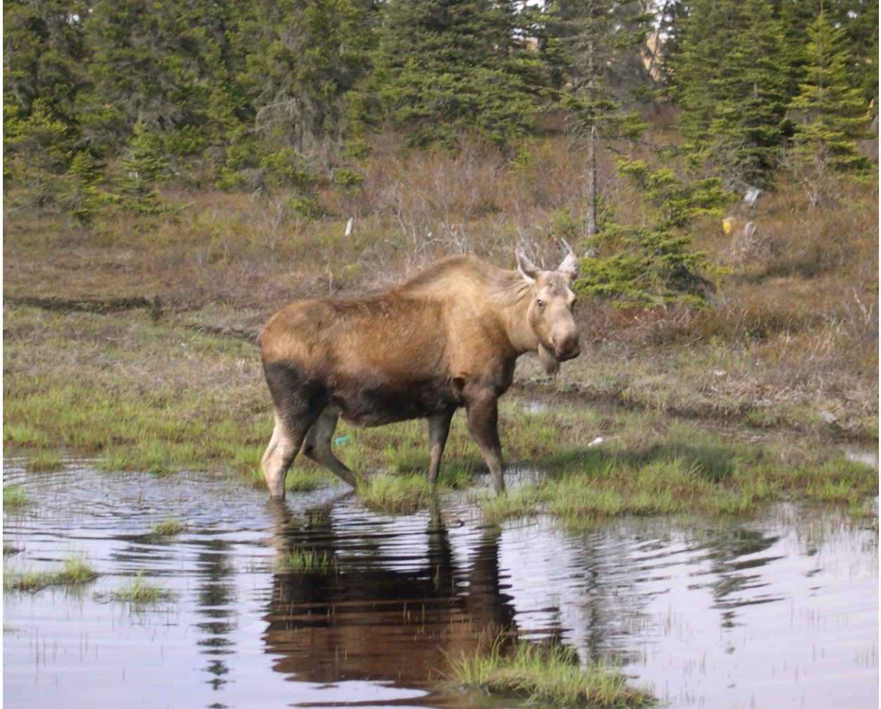
Moose

Cry Wolf was first published on the website in October and was voted Story of the Month.