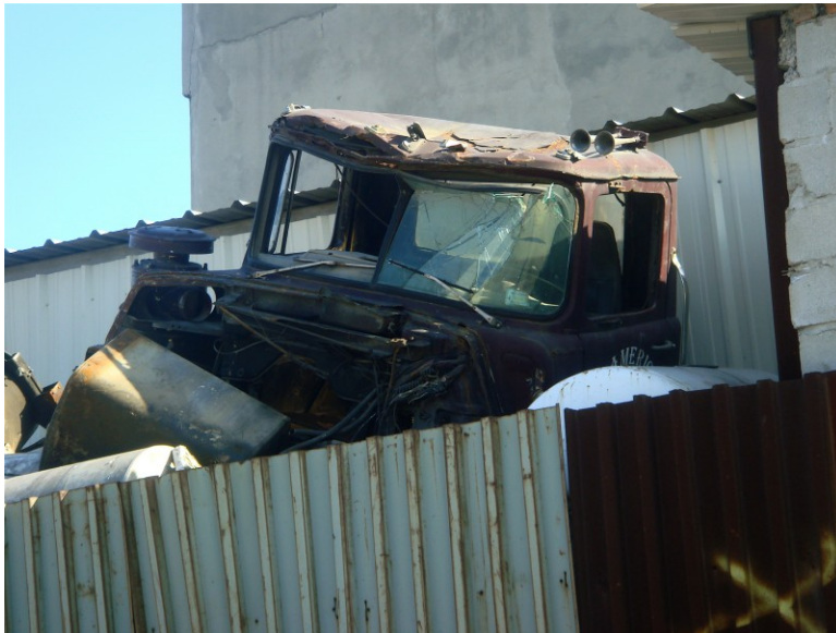
Battered Truck Behind Fence

Joe's Perfect Machine was first published on the website in August and appears here as an Editor's Choice.